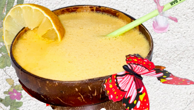
MARACUYA (PASSION FRUIT)

Discover our selection of cocktails crafted with fresh natural fruit, available with or without alcohol.