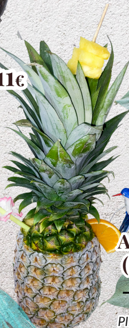
ABACAXI (PINEAPPLE COCKTAIL)